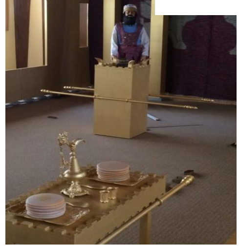
The High Priest at the Altar, and the Shulcan with the Showbread.